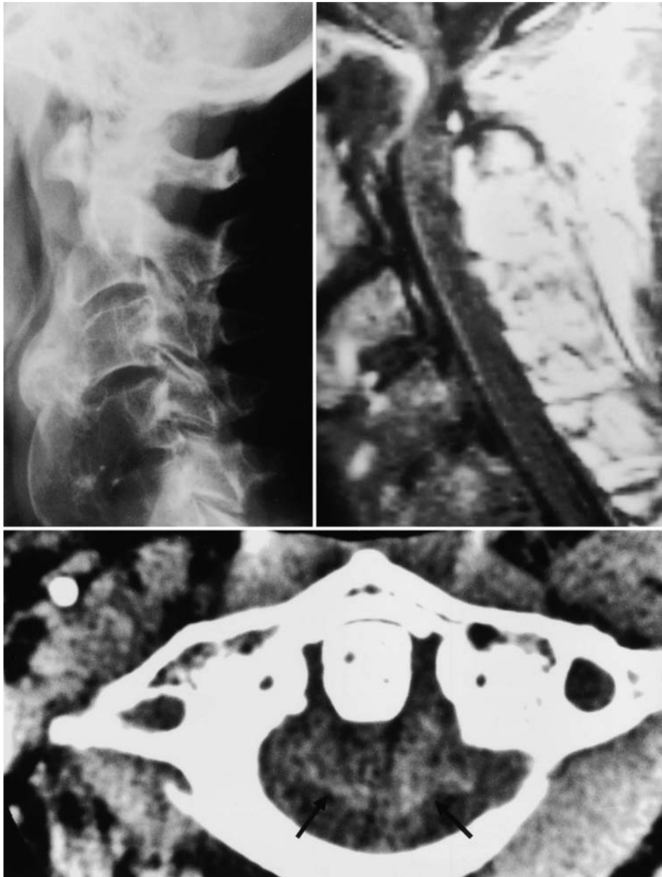
FIG. 1. Upper Left: Preoperative radiograph revealing marked calcification of the ALL. Upper Right: Preoperative MR image revealing marked cervicomedullary compression. Lower: Preoperative axial CT scan demonstrating a retroodontoid soft-tissue mass ( arrows ).

inflammatory tissue. Although the process bears similarity to that in RA, there was no evidence of RA in any of our patients.