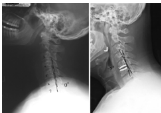
Fig. 2. Preoperative ( left ) and postoperative ( right ) lateral cervical radiographs of a C5-6 Bryan disc arthroplasty showing changes in sagittal alignment from 0 to -5° at the treated segment.

Sagittal balance in the spinal column has become an important and recognized goal in any spinal reconstructive surgical procedure. The normal anatomical configuration of the spinal column has four primary, well-known curves that include cervical and lumbar lordosis and thoracic and sacral kyphosis. The normal cervical spine has a lordosis angle that ranges from 10 to 40° and has a wide range of